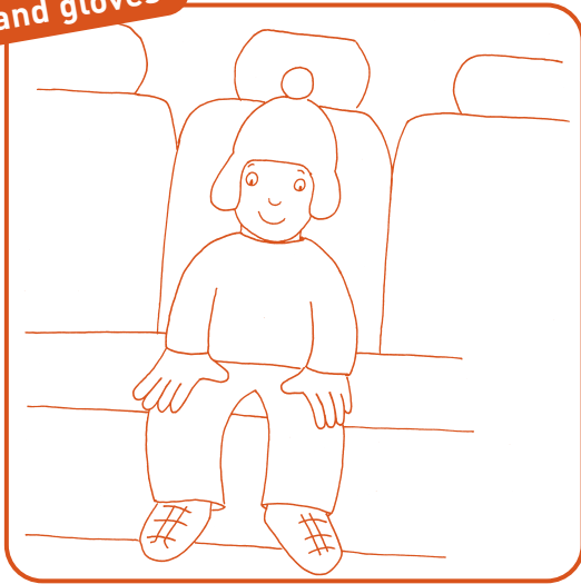
A Hat and gloves